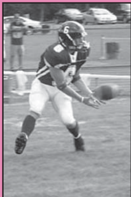
Football Team Wins Pages 8