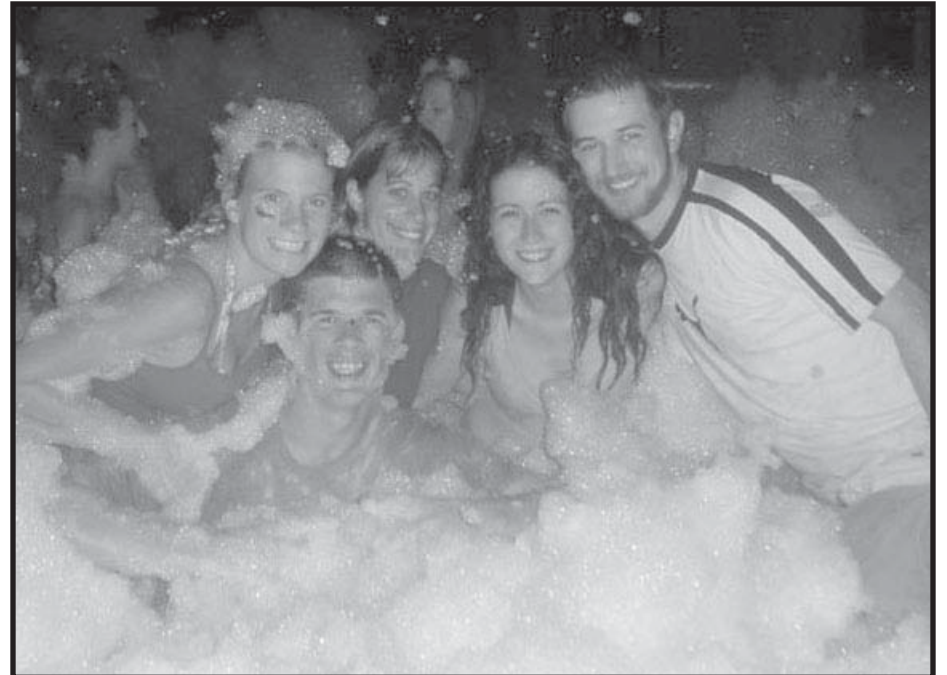
Bethany students enjoy lots of fun and foam at the 2nd SAC sponsored Foam Party held Saturday, September 3 at Bethany Beach. This event is one of many of the "165 for 165" campaign being done to celebrate 165 years of Bethany College.