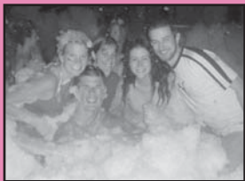
FOAM party Pages 5