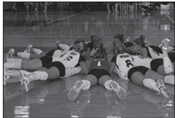
The girls take time to prepare for their matches.

No wonder with the 54 kills that she accumulated over the tournament.