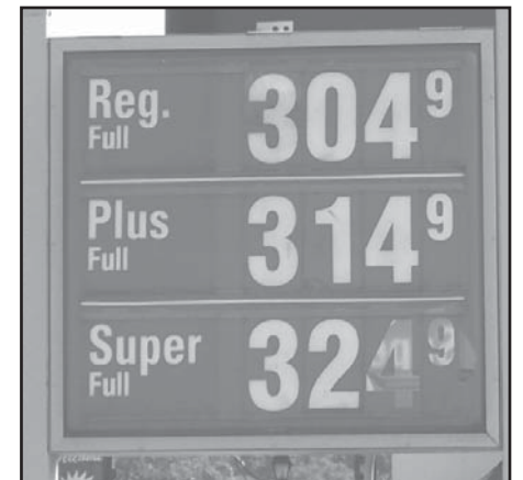
Prices continue to rise over three dollars a gallon for gas in the Ohio Valley.

fall back into an affordable range, many Bethany students will continue their routine of walking across campus and attending on campus events in order to keep entertained in this time of penny-pinching.